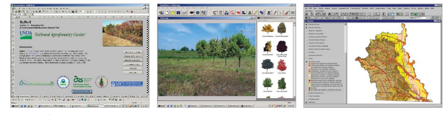
Buffer$: An economic tool for making conservation buffer decisions